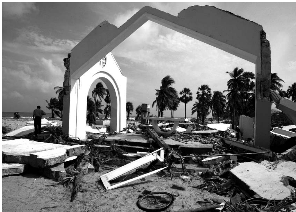
Sri Lanka’s eastern coast was devastated by last December’s tsunami. The disaster led to an unprecedented outpouring of charity all over the world.

Based on our study, the major weaknesses of the ratings agencies are threefold: They rely too heavily on simple analysis and ratios derived from poor-quality financial data; they overemphasize financial efficiency while ignoring the question of pro-